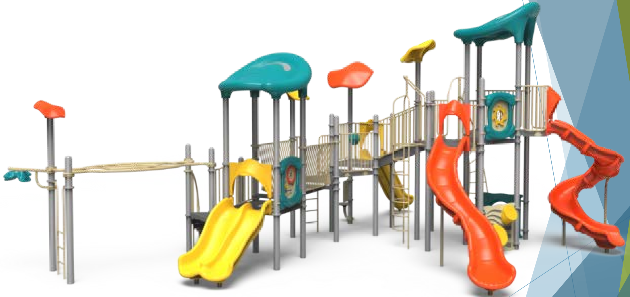
Traditional Playground Equipment